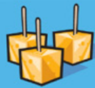
Cheese 50 g (1 ½ oz.)