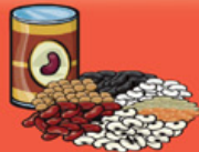
Cooked legumes 175 mL (¾ cup)