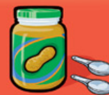
Peanut or nut butters 30 mL (2 Tbsp)