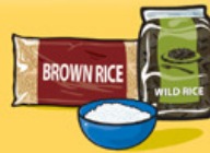
Cooked rice, bulgur or quinoa 125 mL (½ cup)