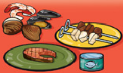
Cooked fish, shellfish, poultry, lean meat 75 g (2 ½ oz.)/125 mL (½ cup)