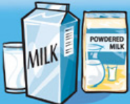
Milk or powdered milk (reconstituted) 250 mL (1 cup)