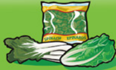
Leafy vegetables Cooked: 125 mL (½ cup) Raw: 250 mL (1 cup)