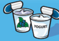
Yogurt 175 g (¾ cup)