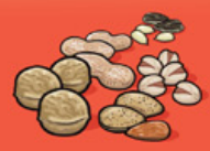
Shelled nuts and seeds 60 mL (¼ cup)