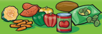
Fresh, frozen or canned vegetables 125 mL (½ cup)