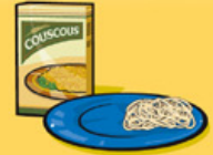
Cooked pasta or couscous 125 mL (½ cup)