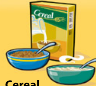
Cereal Cold: 30 g Hot: 175 mL (¾ cup)