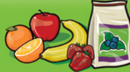
Fresh, frozen or canned fruits 1 fruit or 125 mL (½ cup)